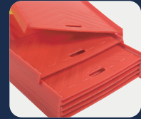
COMPANY NAME OR LOGO