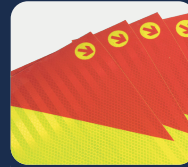
HIGHLY REFLECTIVE SHEETINGS