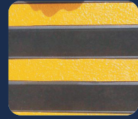
MADE OF POLYURETHANE

IMPORTANT: OUR PRODUCTS ARE MADE OF PREMIUM RECYCLED RUBBER WITHOUT ANY TOXIC SMELL.