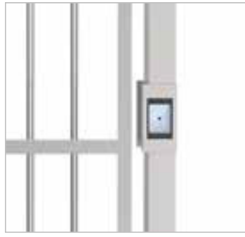
Barcode and QR reader