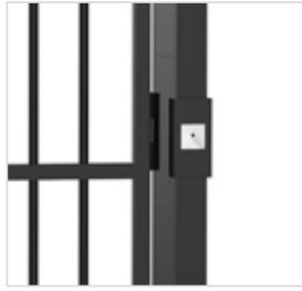
Barcode and QR reader