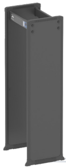
CHECKPOINT "DOLPHIN" EXP-900 (9/6/3)

Detection zones: 9 Dimensions: 2204x910x419 mm Passage dimensions: 2010x760 mm Weight: 28.7 kg Performance: 60 people/min Voltage: 110-240V/50Hz